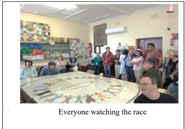
Everyone watching the race