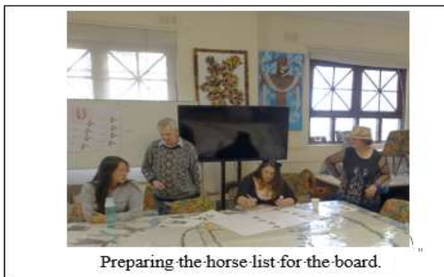
Preparing the horse list for the board.